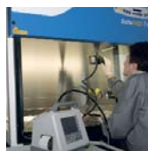
FILTER LEAKAGE TEST