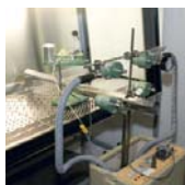
KI DISCUSS TEST