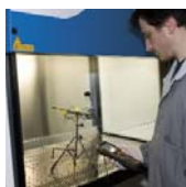
AIR FLOW SPEED TEST

Each Faster cabinet is tested conforming to EN12469:2000, EN 61010:2001 and released with FAT certificate of the tests performed.