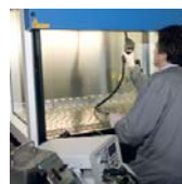
NOISE LEVEL TEST